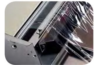
2. Profilo teflonato Teflon-coated section