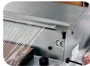
1. Particolare filo caldo Heated cutting tread